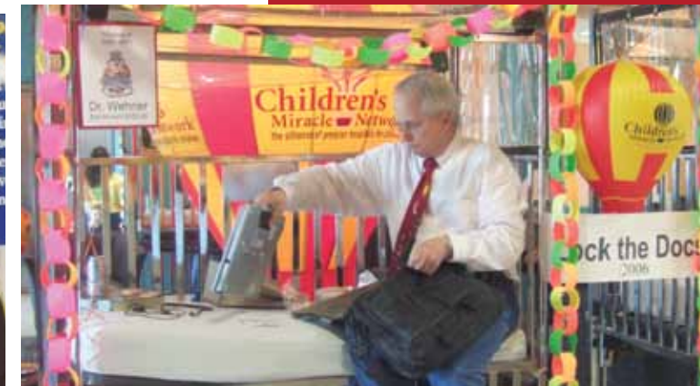
2009 Miracle Kids at McAlisters