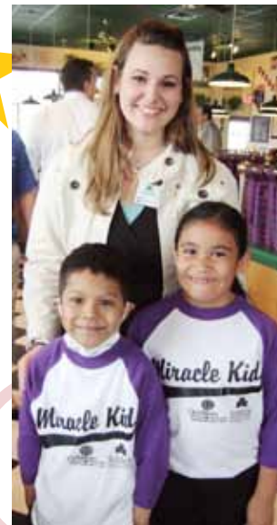
2009 Miracle Kids at McAlisters

Shannon Clinic Pediatrician. "Pediatrics has changed greatly over the years. In the bigger cities, general practitioners now refer to specialists and you may lose touch with your patients. Here in a smaller town, we are 200 miles away from those kinds of resources. CMN has provided us with the training, the knowledge and the back-up support so that we're able to care for the children here. We're able to make the diagnosis; we're able to see them in the office; see them and take care of them in the hospital and at the same time allow them the comfort of being able to stay here in San Angelo instead of having to travel 200 miles every week, every other day to receive their care. It's been a tremendous boost having CMN."