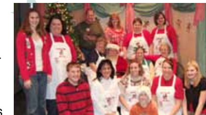
2007 Cookies & Milk with Santa