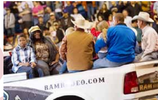
2011 Miracle Kids at the San Angelo Rodeo