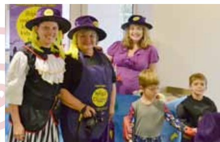
2011 Spirit Halloween Costume Party

through the Women's & Children's unit and I've seen all the plaques on pieces of equipment- on rocking chairs, on doors that say 'paid for by Children's Miracle Network.' During the first Radiothon we raised $27,000 and we proudly are boasting a total of $163,000 from our tenth event." Shannon's pediatricians and nursing staff play a huge role in CMN. Their talent and expertise, combined with the $1.18 million in new equipment funded by CMN, have saved numerous local children and their families from making long trips to receive treatment at other facilities.