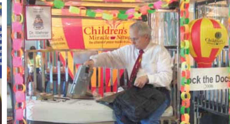
2009 Miracle Kids at McAlisters