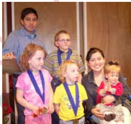
2005 Miracle Kids

already so I got to see how much it benefited the hospital. When I heard CMN was coming here I couldn't have been happier. I think I was one of the first people to sign up to help."