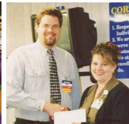
CMN's first donation from WalMart in 2002