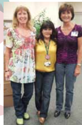
2010 Miracle Jeans Day