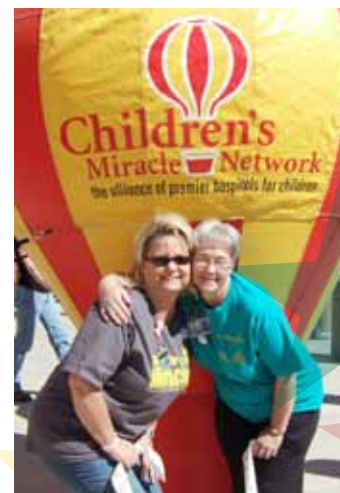
2008 Volunteers at Rodeo Day