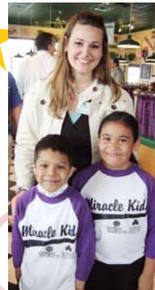
2009 Miracle Kids at McAlisters